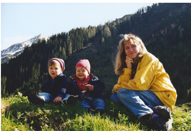
Figure 2: Family picture of a study participant with CMTX who stressed the importance of medical advice and the awareness of challenges associated with pregnancy and who is active in her local self-support group.

The majority of participants stressed the value of a fulfilled family life and had a positive view of having children, despite being aware of the challenges associated with pregnancy (Fig. 2). Medical advice and expert opinion for specific medical interventions are recommended. Important issues are assistance and support in caring for the family. Women with a significant handicap will generally need help in the household and may have limited physical reserves for their tasks as a mother. Personal recommenda-